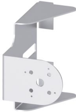
shaft support for harsh conditions accessory for: door mounted rotary operator 3VA13/14; 3VA23/24