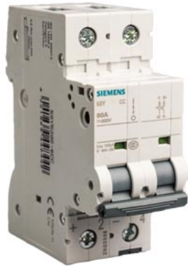
Miniature circuit breaker 400 V 10kA, 2-pole, C, 10 A