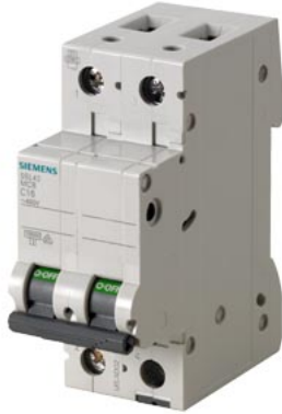
Miniature circuit breaker 400 V 10kA, 2-pole, B, 13A Circuit breaker 400 V 10kA, 2-pole, B, 13A