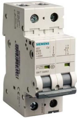
MCB Icu=15KA 400V 2P C1