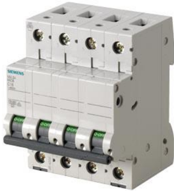
Miniature circuit breaker 400 V 4.5 kA, 4-pole, C, 32 A